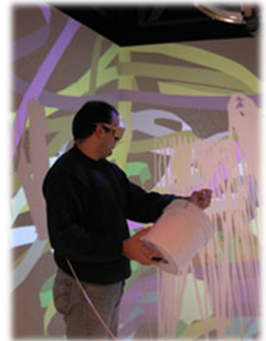
CavePainting (Keefe 2001)