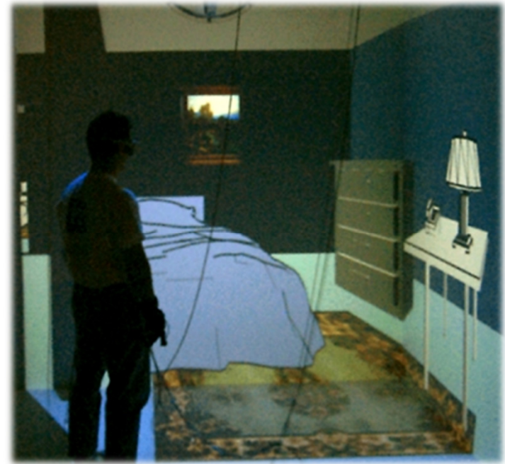
Hand gestures and speech [Van Dam et al. 2000]