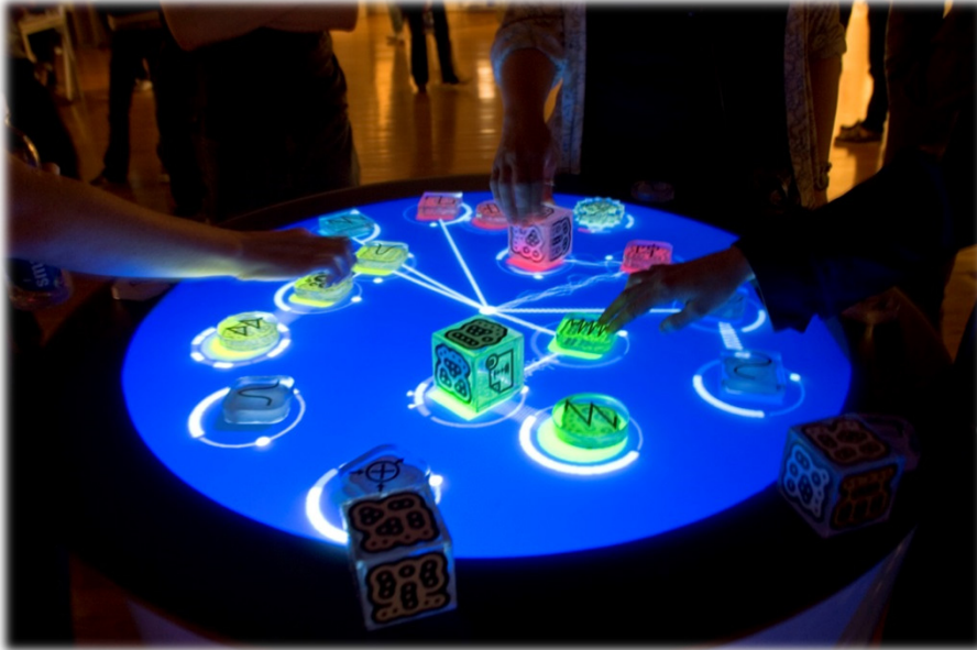
Reactable (Jorda, 2005)