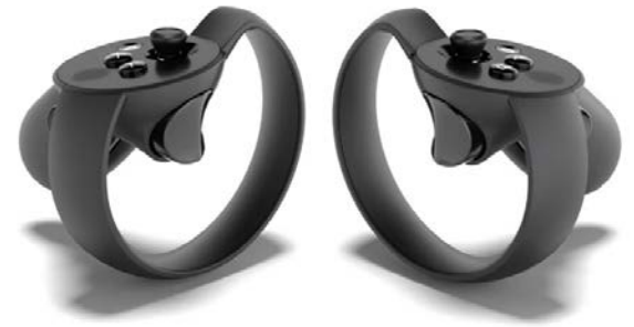
Oculus Touch Controllers