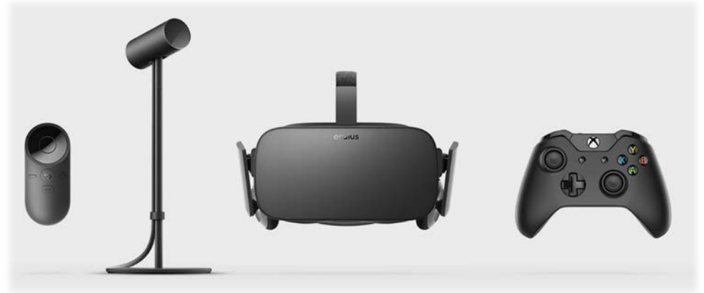
Initial Oculus Rift kit

6 DOF tracking with infrared cameras (“sensors”)